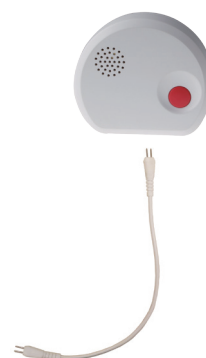
WPC-20 Water Probe Cable 20 cm